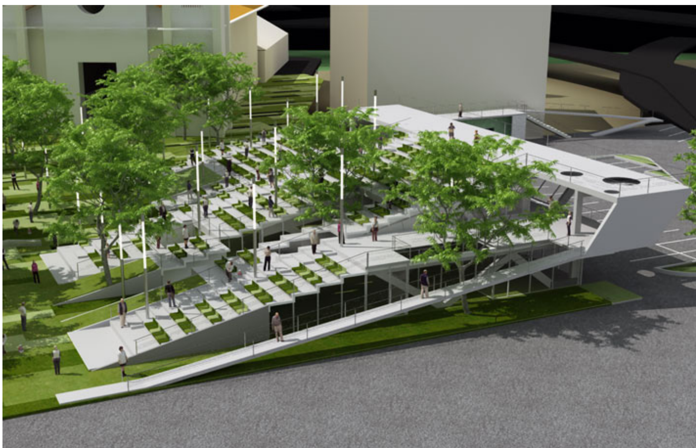
2, 3) Competition - Visualization of the parochial library (Second fase)