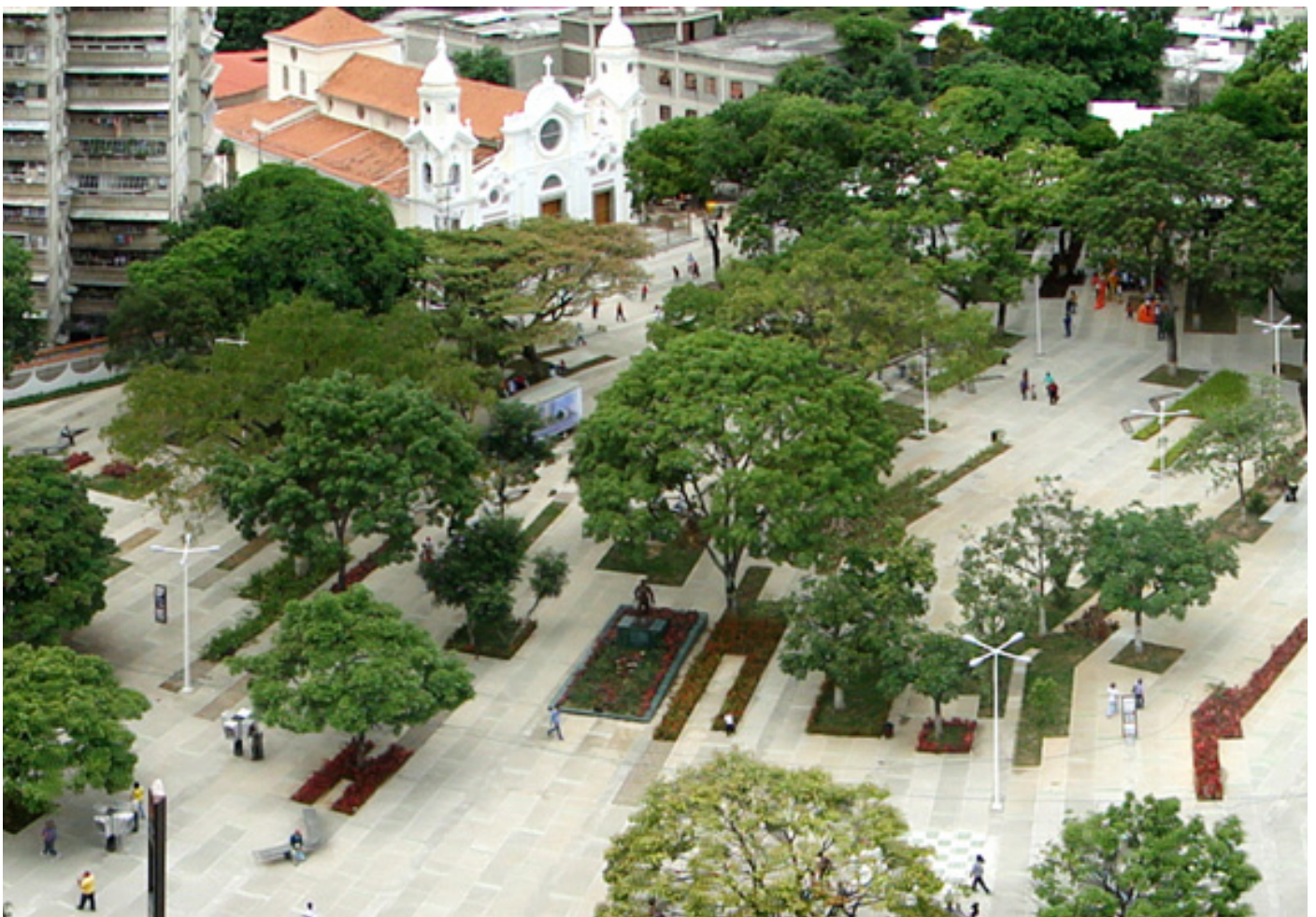
1) Aerial photo of the project

The project is an initiative from the Bureau of infrastructure of the parish, the projects was presented to the public assembly in 2009, and included the proposals and expectations of the local people. The LAB. PRO. FAB design joins the remodeling proposal of the Community, and 90% of the workers involved where from the local area.