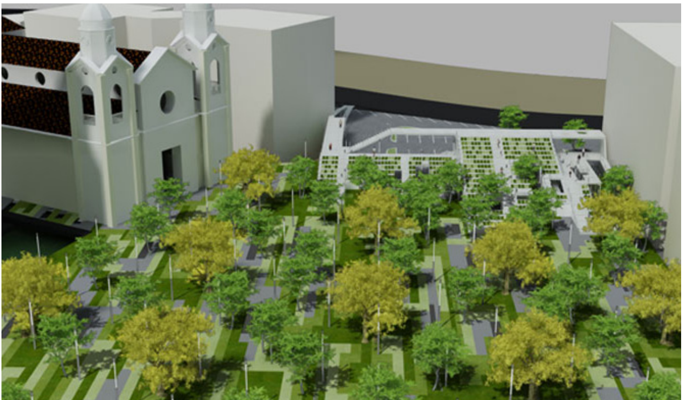
4, 5) Competition - proposal for the the old Bolívar Square.