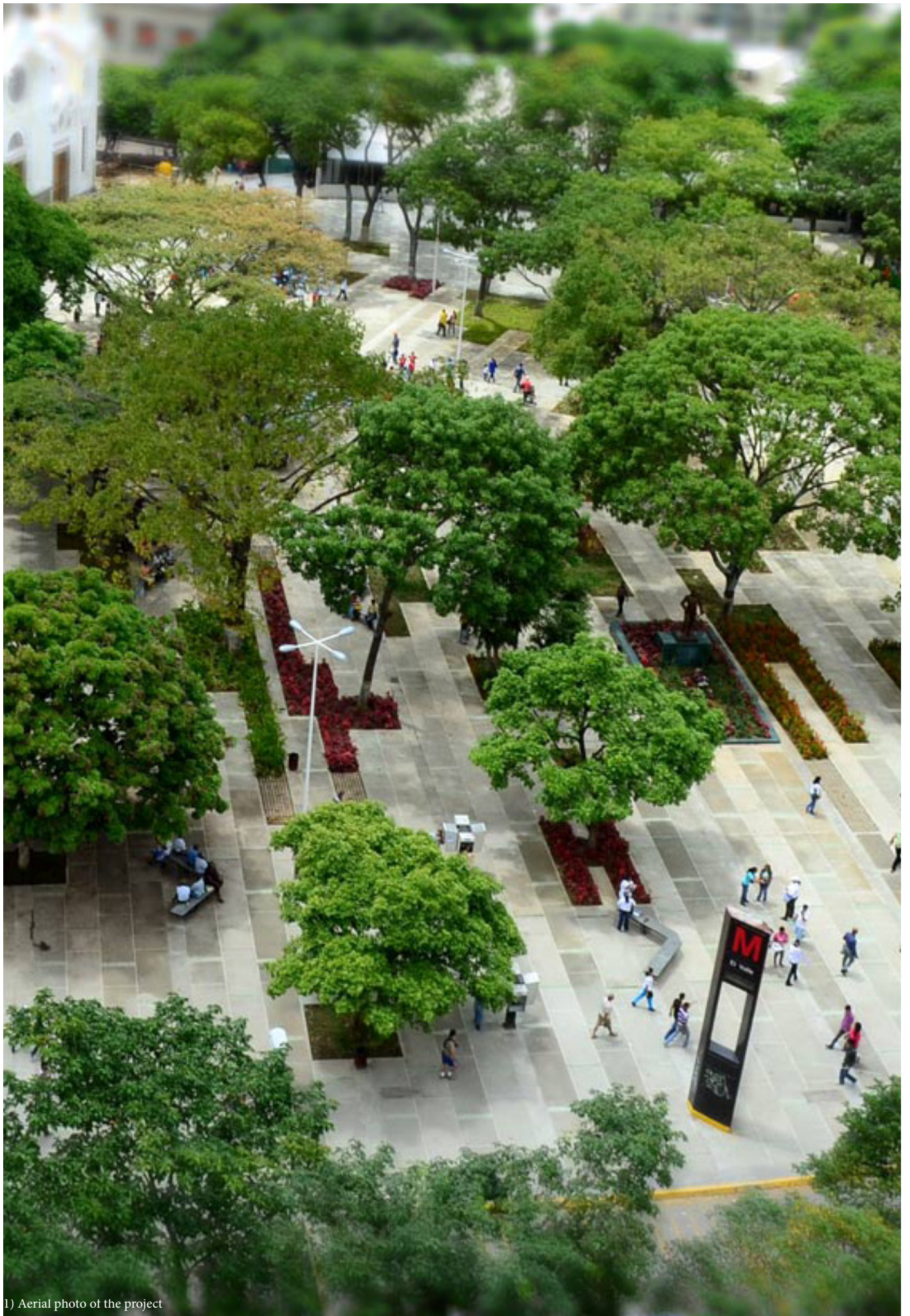
1) Aerial photo of the project